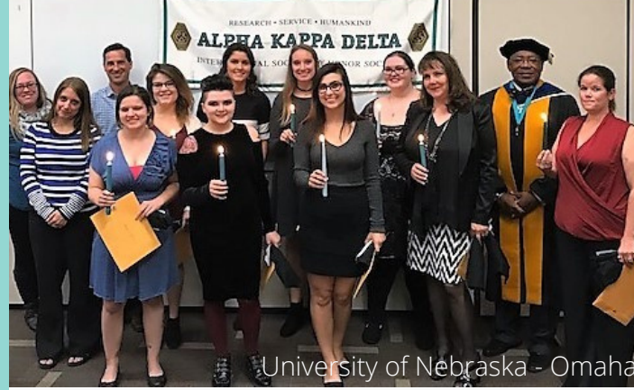
University of Nebraska - Omaha

Chapters may apply additional criteria for both undergraduate and graduate students. Sociology faculty members and those employed as sociologists may be inducted through their institution.