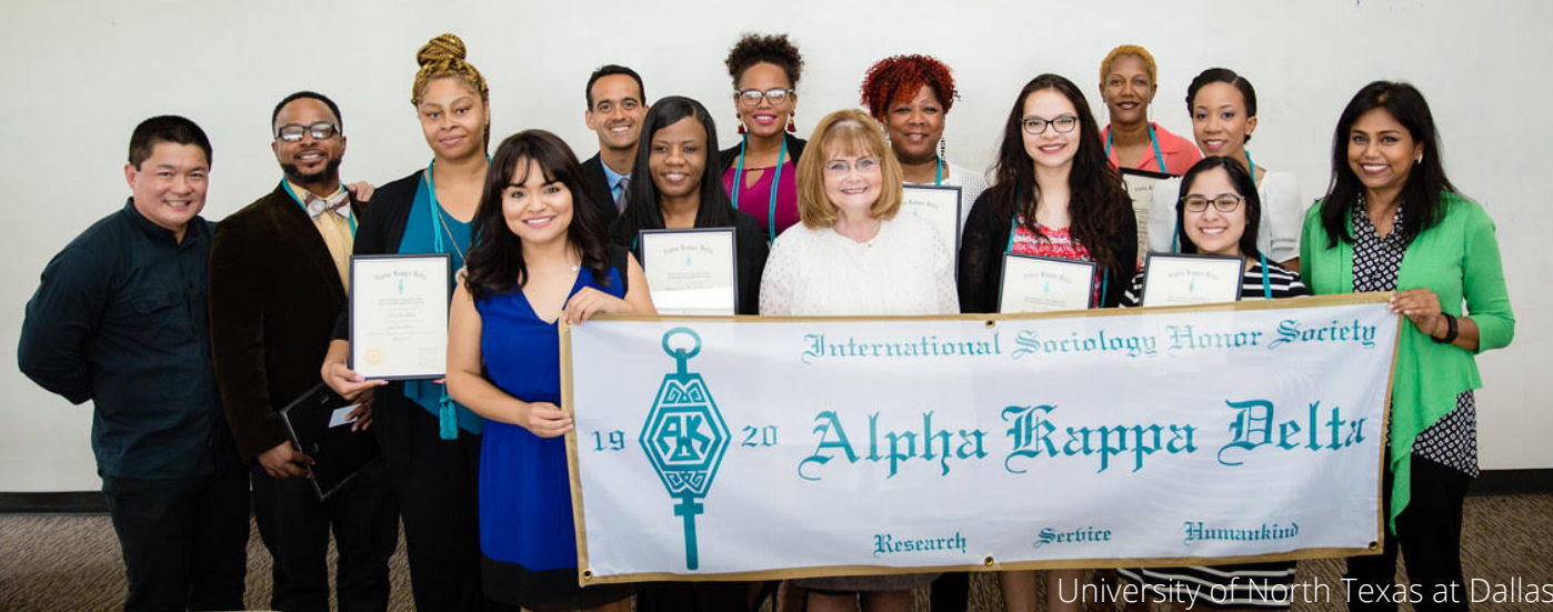
University of North Texas at Dallas